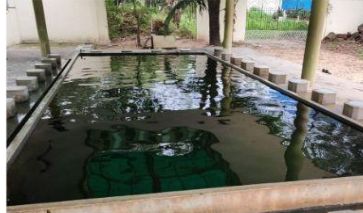
Bunks & Tanks