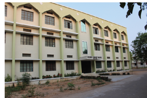
Golden Jubilee Block