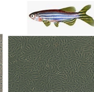
DRE Cell line