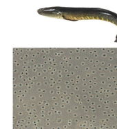
CSCVC Cell line